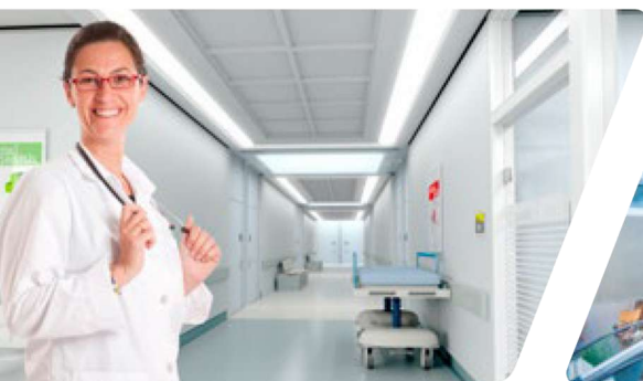
clinics and hospitals