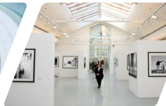
galleries and museums